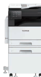
With Tray Module and Cabinet